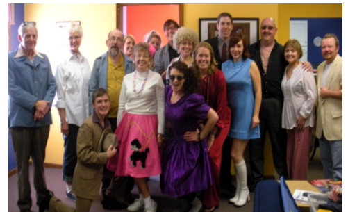
Photos taken while filming a promotional video for Dancing Through the Decades. To watch Trinity's music video, visit: www. trinityinhomecare.org

You are invited to enjoy a fun and entertaining evening of great music & dancing ! Come have some fun while raising money for Trinity clients and services. We hope to see you there!