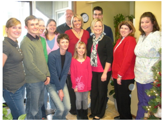
Trinity's management and office staff during the holiday potluck and gift exchange.

Thank you for your business and support in 2010! We appreciate the opportunity to provide quality services to you or your loved ones! Over the course of 2010, Trinity services touched over 600 households in Douglas County, providing over 160,500 hours of support. We look forward to continuing our relationship with each of you!