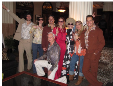
Dance attendees pose for a groovy photo together.