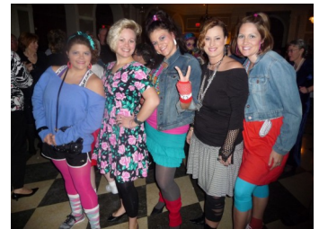
Attendees show off their wicked rad outfits