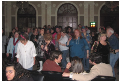
Dance attendees cut a rug on the dance floor in the Eldridge Ballroom