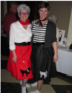
Attendees sport some swell 50's attire. Nifty!

Trinity's annual fundraising event, "Dancing through the Decades", was a great success! The dance floor was packed and everyone had a groovy time! The dance raised over $6,500, which is twice the amount raised last year. Thanks to all those who attended, sponsored, or otherwise supported the event! We look forward to a great time "Dancing Through the Decades" next year. Be sure to check out the music video created by Free State High School students at: http://www.youtube.com/watch?v=RebsrbRzoJM