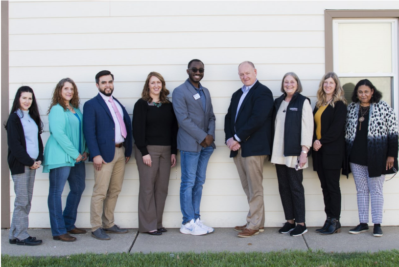
Trinity In-Home Care 2022 Board of Directors